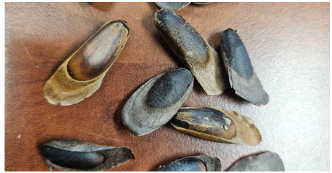
Above: Pine nuts from a Coulter Pine